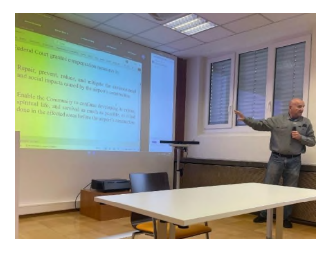
Figure 3 Guest talk.

environmental justice (Figure 3). I explained two examples with indigenous communities in Mexico, where I applied multi-criteria decision analysis and exploratory modelling methodologies to bridge the gap between technical-scientific knowledge and local knowledge, ensuring that these traditionally marginalized communities are transparently incorporated into policymaking. This discussion underscored (1) the importance of analytical tools in participatory approaches for addressing complex socio-environmental challenges, and (2) how research can go beyond the isolated confines of academia to actively address real-world challenges in the Global South, where it is crucial to engage with the legal mandates embedded in both environmental conflicts and planning efforts.