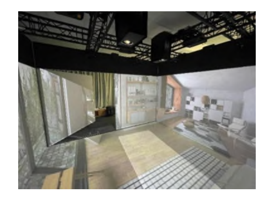
Figure 1 Visit and demonstration of the SFL insfrastructure.